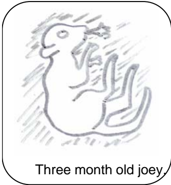
Three month old joey.

After growing in the mother's body for a month, the joey is born blind and deaf, without any hair and only 20 millimetres long. It crawls to the pouch where it stays for about 8 more months feeding on milk from it's mother's nipple. Then it begins coming out to feed on grass, hopping back into the pouch whenever it is tired, scared or cold. There the joey can hide away safe and warm.