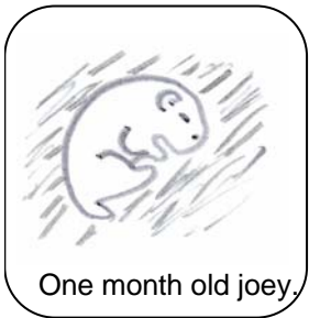
One month old joey.

Kangaroos are marsupials. This means babies are carried and fed in their mother's pouch.